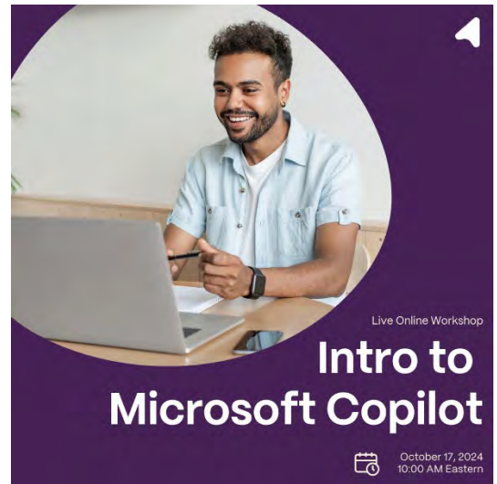
Intro to Microsoft Copilot