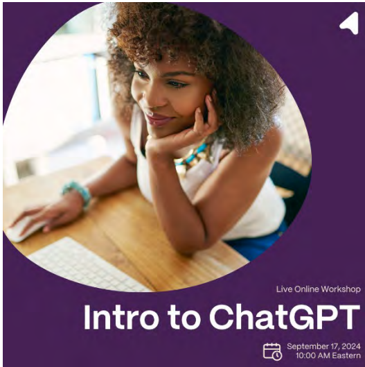
Intro to Chat GPT