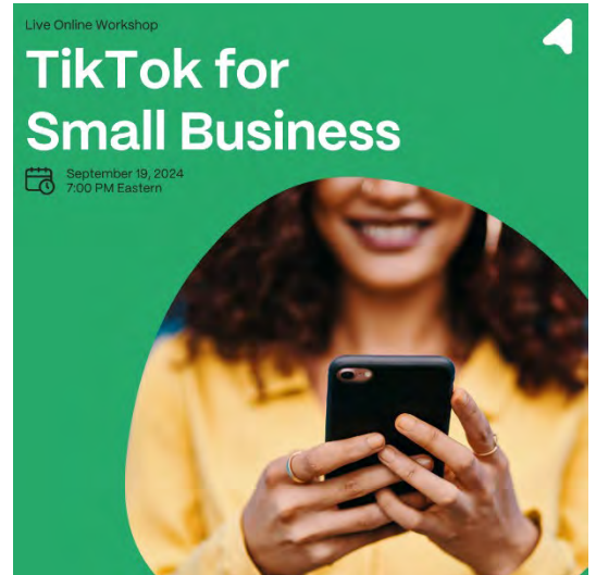
TikTok for Small Business