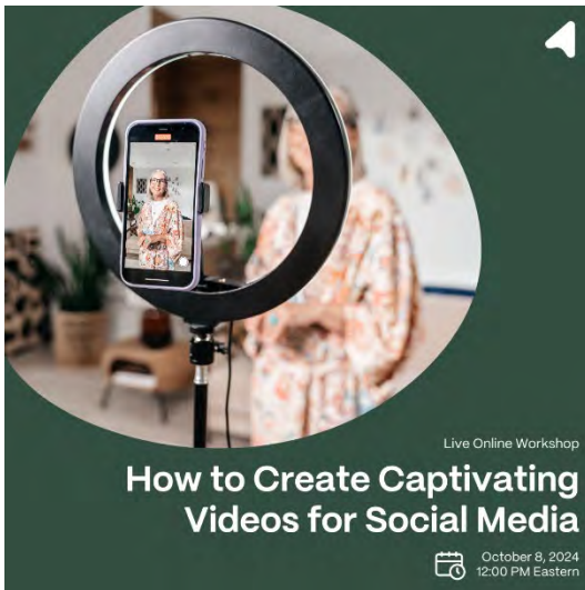
How to Create Captivating Video for Social Media